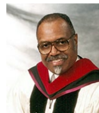
Hartford Memorial Baptist Church, Detroit, MI

Some pastors from top-giving churches talk on why this commitment is important to their congregations: