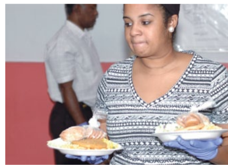
American Baptists serve food to people in need.