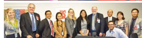
Refugees waiting to hear about resettlement plans in the U.S. (top). Meeting of Baptist leaders (below) with the U.S. State Department on resettlement for Burmese refugees.