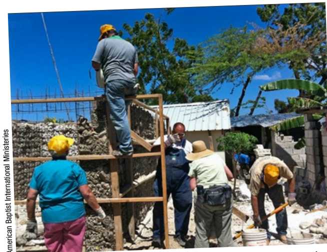
American Baptist International Ministries