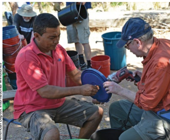
American Baptist mission work in Nicaragua

American Baptist International Ministries