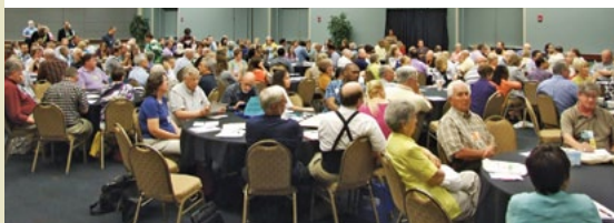
Mission Summit Conversations occur at the 2013 Biennial Mission Summit, where attendees consider how their local churches can be Transformed by the Spirit .

The fact is, every institution is facing unprecedented challenges that come with unrelenting change. American Baptist churches are not immune. But we do have a call and access to resources that secular organizations do not. Transformed by the Spirit is not a static program to be completed but a dynamic, disciplined process by which we discern how God's Spirit is already at work and invites us to join. Transformed by the Spirit invites American Baptists to name and address challenges in changing environments. We need to make "adaptive changes," changes that are in response to a changed environment, changes that unleash our Baptist DNA for innovation. We must make changes that embrace the transformative work of the Spirit in the life of the church. Visit www.abc-usa.org/transformed-by-the-spirit to learn more!