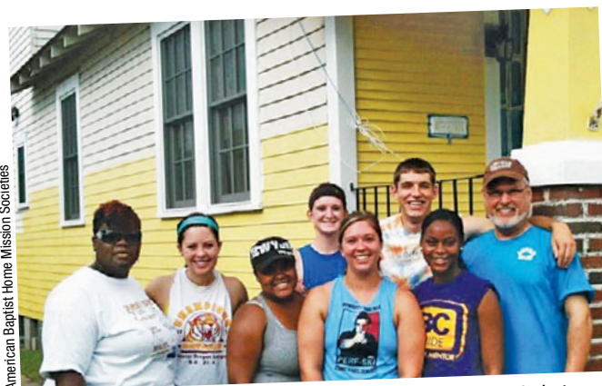
American Baptist Home Mission Societies