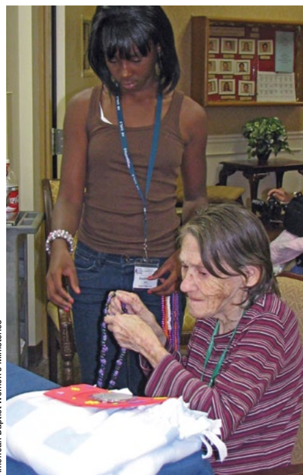
A National Gathering of Girls participant volunteers at the Judson Retirement Village.