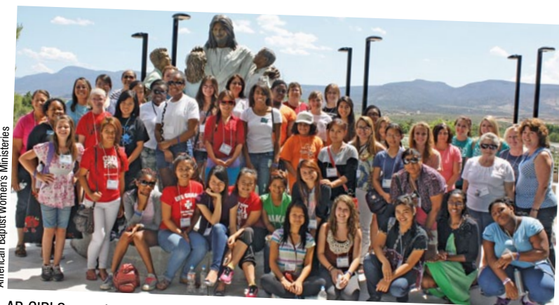
American Baptist Women's Ministries