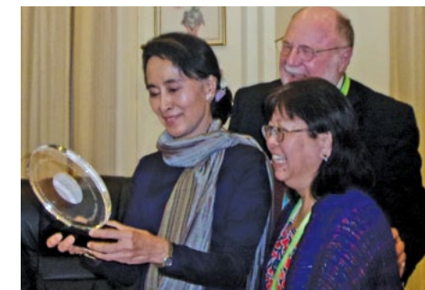
A recent mission group travelled to Burma for advocacy work and there met with Daw Aung San Suu Kyi, a Burmese opposition politician and chairperson of the National League for Democracy (NLD) in Burma and Nobel Peace Prize winner in 1991.