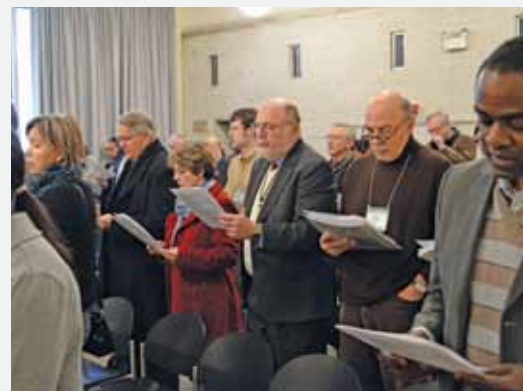
Baptist World Alliance board executive committee worship at the ABC Mission Center.

needs and callousness of an increasingly secular society. At the regional, national and international levels as well, vital work in the name of the Gospel has been done ecumenically.