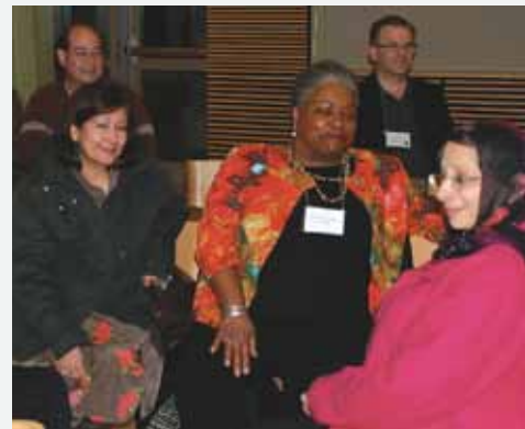
The Baptist/Muslim Dialogue meeting, bringing together different faith groups to learn from one another.