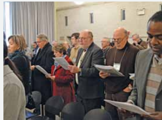
Baptist World Alliance board executive committee worship at the ABC Mission Center.

needs and callousness of an increasingly secular society. At the regional, national and international levels as well, vital work in the name of the Gospel has been done ecumenically.