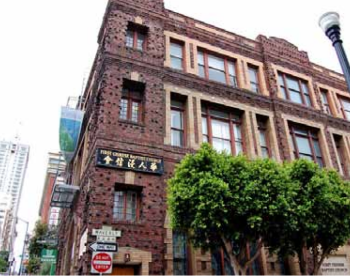
First Chinese Baptist Church, San Francisco