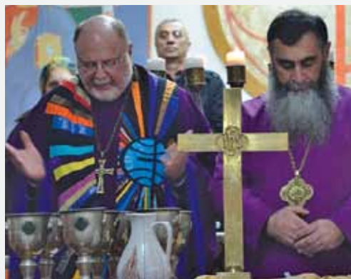
Medley, pictured with Bishop Ilia Osephashvili, the new Archbishop of the Evangelical Baptist Church of Georgia