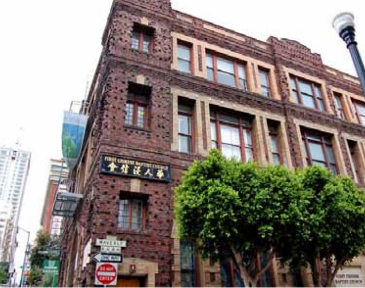
First Chinese Baptist Church, San Francisco