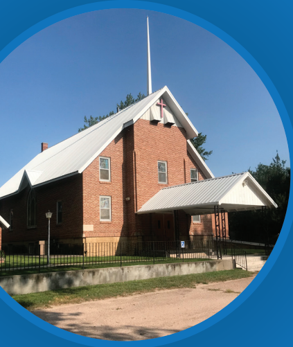
Arthur Baptist Church

The notion of helping one's neighbor is an ongoing theme and tradition at Arthur Baptist. An annual community program called, Give Where You Live involves completing various projects in the town that need immediate attention. Everyone participates until all of the requested tasks are finished. This is a testament to the type of people living in the community—people who care about their neighbors.