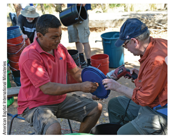
American Baptist mission work in Nicaragua