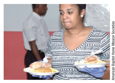
American Baptists serve food to people in need.