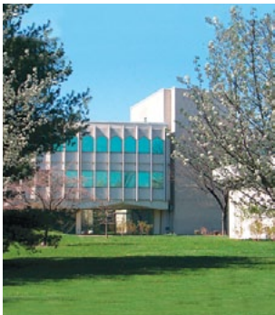
American Baptist Churches Mission Center in Valley Forge, Pennsylvania

From some Christian perspectives, we are living in a post-denominational world: an age when burdensome administrative structures and broad relationships necessarily have been replaced by smaller, homogenous and more centralized units of ministry and mission.