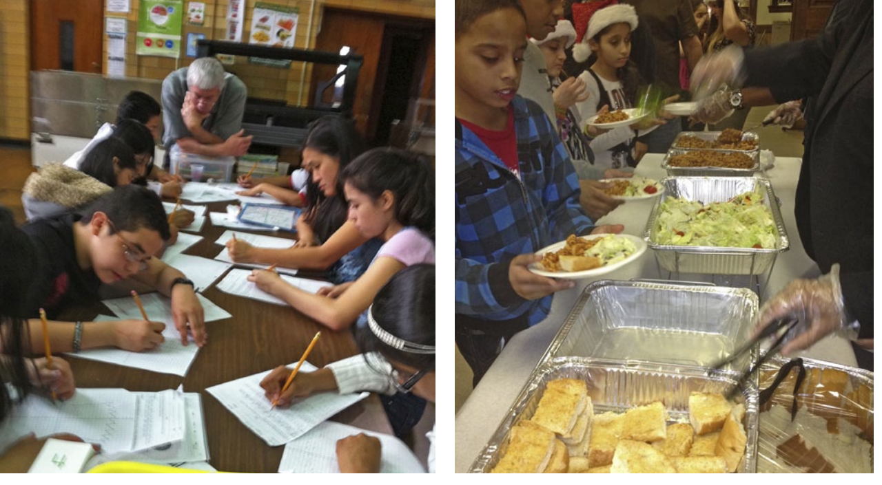
American Baptist Churches engage in work to reach out and connect with their local communities.

proven to be an important way of focusing the groups' attention around Christ."