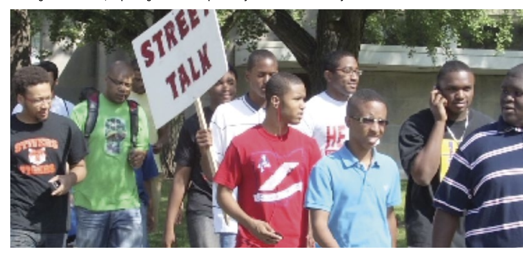
Churches will find a variety of missional expressions through Transformed by the Spirit . Omega Baptist Church in Dayton, Ohio, participated in a trial group early in the process, working with youth in crisis, a VA hospice and a women's shelter.