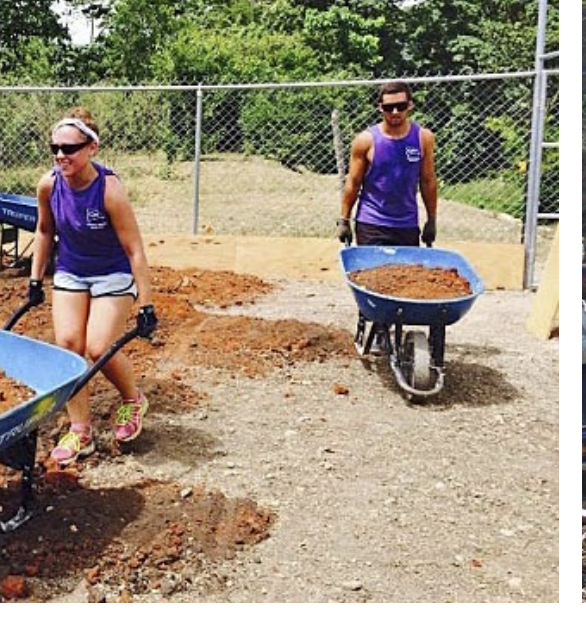
Members of the Dominican Republic Mission Team work together to begin a garden.

and ABC of the Rocky Mountains. Other American Baptist organizations, among them ABC of Greater Indianapolis, Philadelphia Baptist Association, and the Evergreen Association of American Baptist Churches, also have been actively involved in the Transformed by the Spirit process.