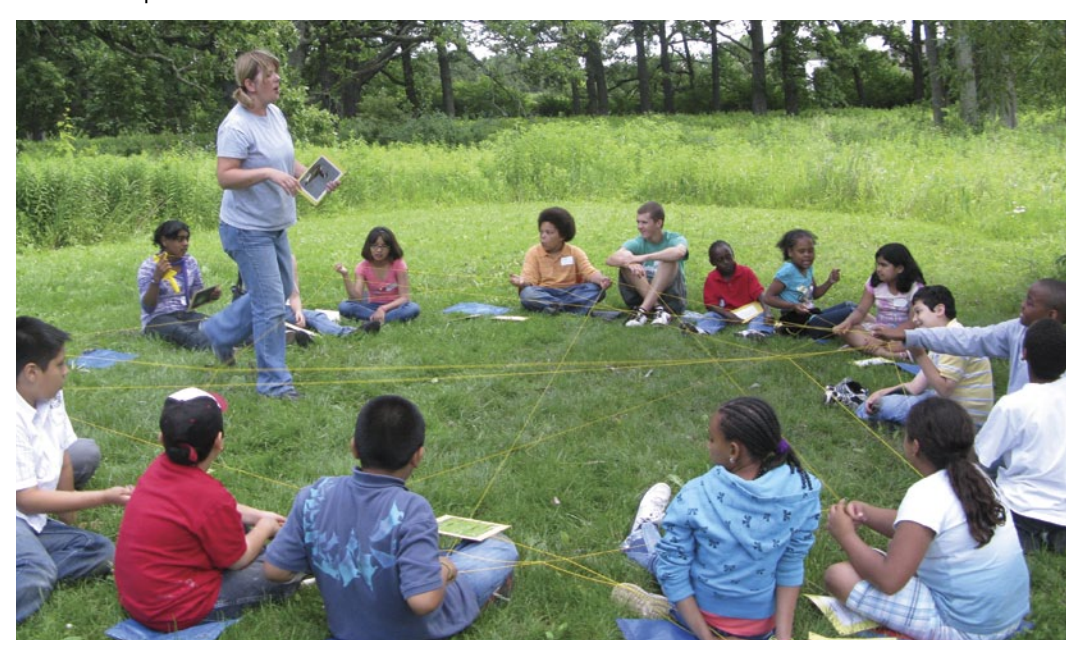
A Cool Summer Experience, a ministry of First Baptist Church, Waukegan, IL, is a faith-based program that targets 4th-5th graders at serious risk. They match outdoor experiential learning with rigorous content, imparting a sense of spirituality and of awe of the mysteries of creation.