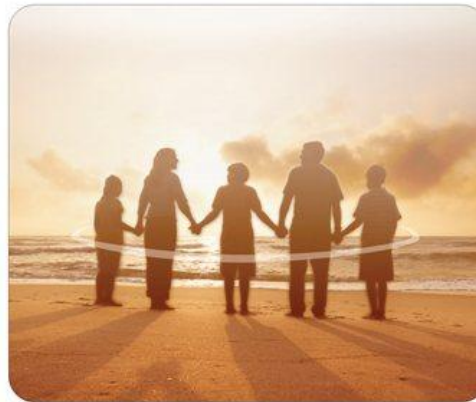
Where Everyone is Treated Like Family