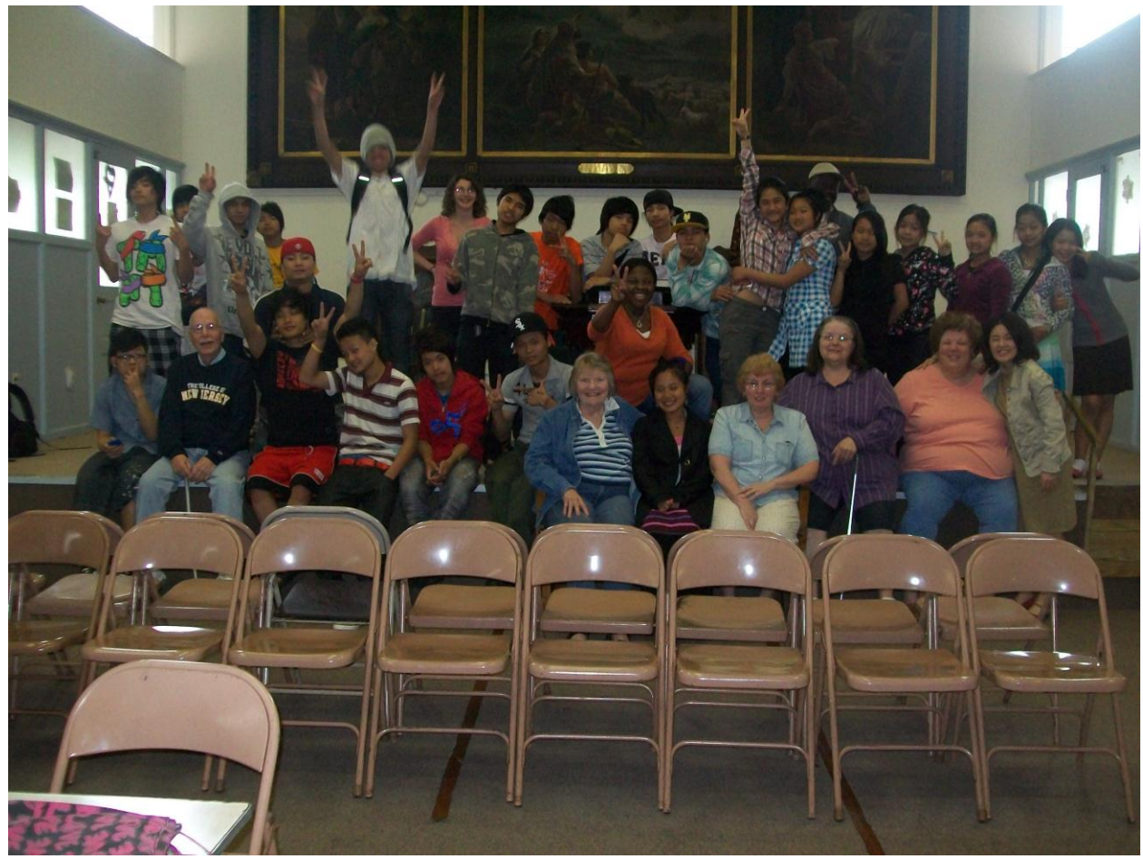
Caption H Celebrating after an ESL (English as a second language) class