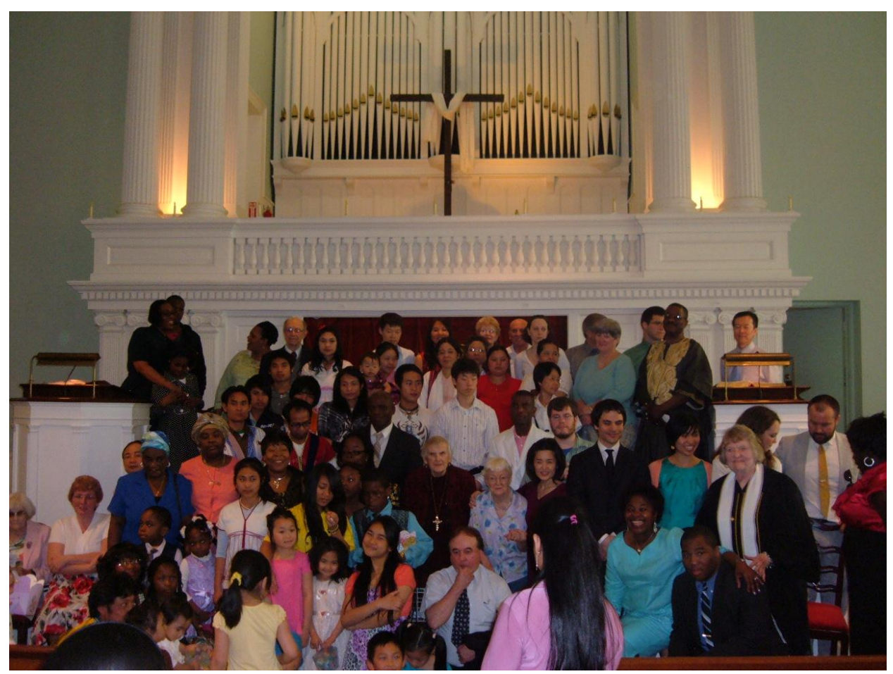
Caption A A Diverse Community