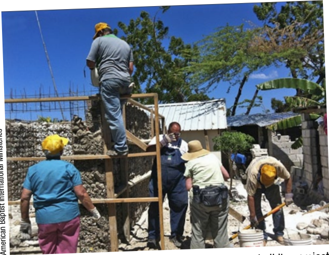
American Baptist International Ministries