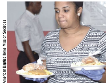
American Baptist serves food to people in need.