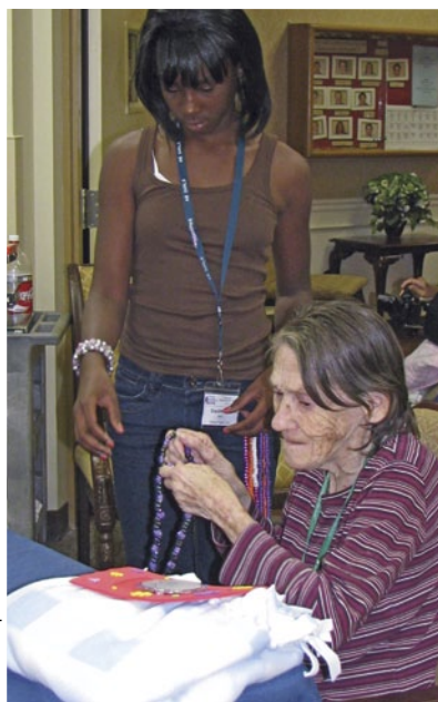
A National Gathering of Girls participant volunteers at the Judson Retirement Village.