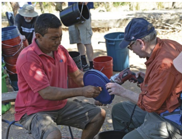
American Baptist mission work in Nicaragua

American Baptist International Ministries