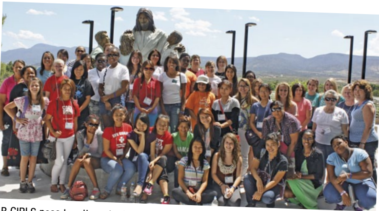
American Baptist Women's Ministries