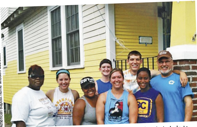
American Baptist Home Mission Societies