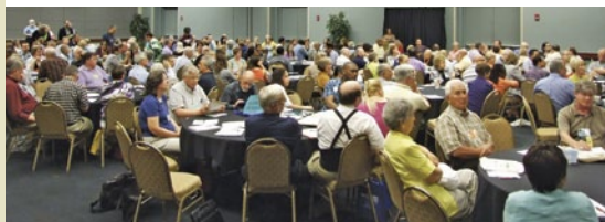
Mission Summit Conversations occur at the 2013 Biennial Mission Summit, where attendees consider how their local churches can be Transformed by the Spirit .

The fact is, every institution is facing unprecedented challenges that come with unrelenting change. American Baptist churches are not immune. But we do have a call and access to resources that secular organizations do not. Transformed by the Spirit is not a static program to be completed but a dynamic, disciplined process by which we discern how God's Spirit is already at work and is inviting us to join. Transformed by the Spirit invites American Baptists to name and address challenges in changing environments. We need to make "adaptive changes," changes that are in response to a changed environment, changes that unleash our Baptist DNA for innovation. We must make changes that embrace the transformative work of the Spirit in the life of the church. Visit www.abc-usa.org/transformed-by-the-spirit to learn more!