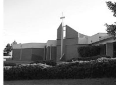
Crossroads American Baptist Church Northglenn, Colorado