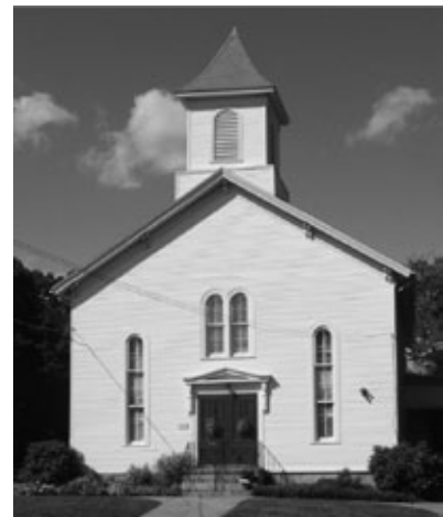
Niantic Baptist Church Niantic, Connecticut

Niantic Baptist Church has demonstrated its caring spirit by helping those in need for more than 100 years—and the congregation embraces RMMO as another opportunity for giving. Though small and struggling financially, the church has given generously to RMMO, and was listed as one of the top giving congregations this past year. Niantic Baptist Church is proud to be one of the two recipients of the 2010 Widow's Mite Award.