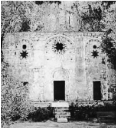
Ancient ruins near Antioch